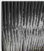
Cooling tower grids